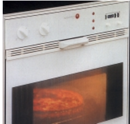
Oven Handle: High stiffness, low discoloration and distortion, and light color availability.