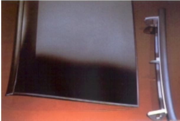
T-Roof Rail: Stiffness, strength and toughness, combined with good surface appearance.