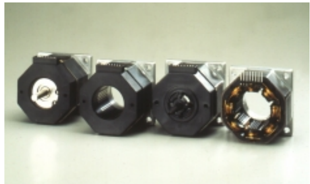
Encapsulated Motor Stator: All-in-one molded stator assembly, lower production time, and cooler operation.